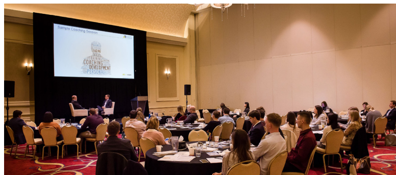
2018 FOX Rising Gen Forum, Chicago

1:45 pm Closing Remarks and Staying Connected